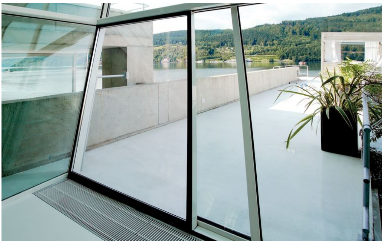
Automatic linear sliding door system for use on inclined glass façades